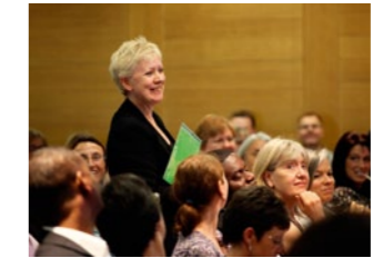
Quality Conference 2009