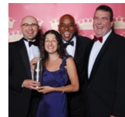
PQASSO wins effectiveness award, 2008