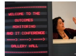
Monitoring and IT Conference 2009