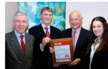
Jack Straw presents first PQASSO Quality Mark award